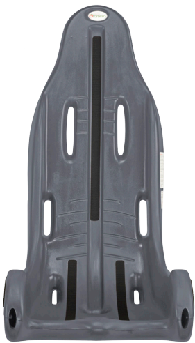
Large Shell (ML)

Choose a Shell size to determine your options