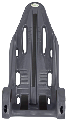
Small Shell (MS)