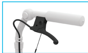
Single Hand Tilt