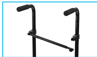
Folding Rigidizer Bar