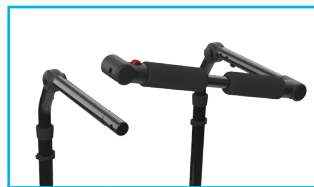
Folding Angle Adjustable Push Handle