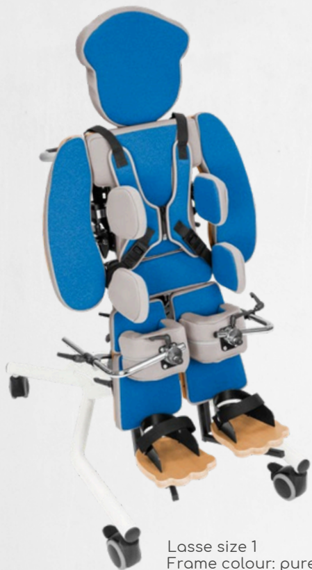
Lasse size 1 Frame colour: pure white Fabric: light blue/grey

The height adjustable upright and supine stander Lasse moves young users from a supine to a standing position and enables them to stand at eye level with their friends. The variable transfer height ensures a safe, stress-free positioning of the user in supine.