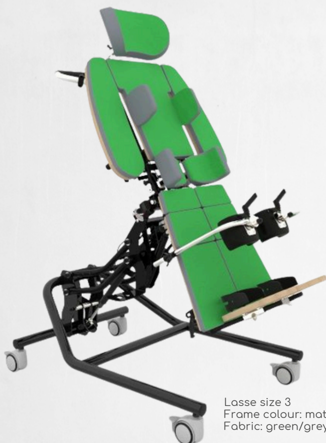
Lasse size 3 Frame colour: matt black Fabric: green/grey

The recline of the Lasse upright and supine stander can be steplessly adjusted and gently brings users of all ages to a standing position. Since the upright and supine stander adapts to users from head to toe, Lasse perfectly meets individual needs.