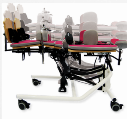
Height adjustable for transfer & improved access