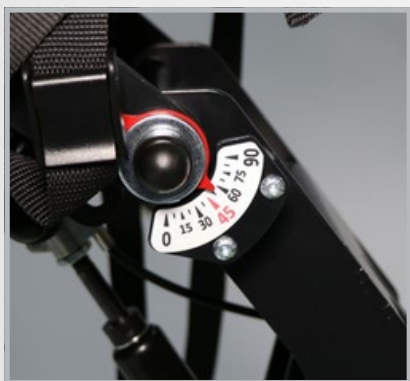
Degree indicator for height adjustable frame