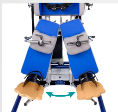
Individual leg abduction