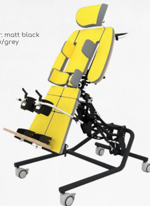
Lasse size 4 Frame colour: matt black Fabric: yellow/grey