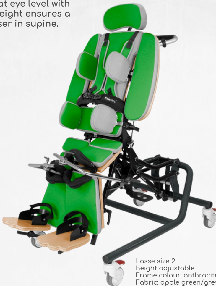
Lasse size 2 height adjustable Frame colour: anthracite grey Fabric: apple green/grey