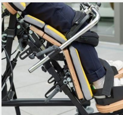
Leg positioning, angle adjustable