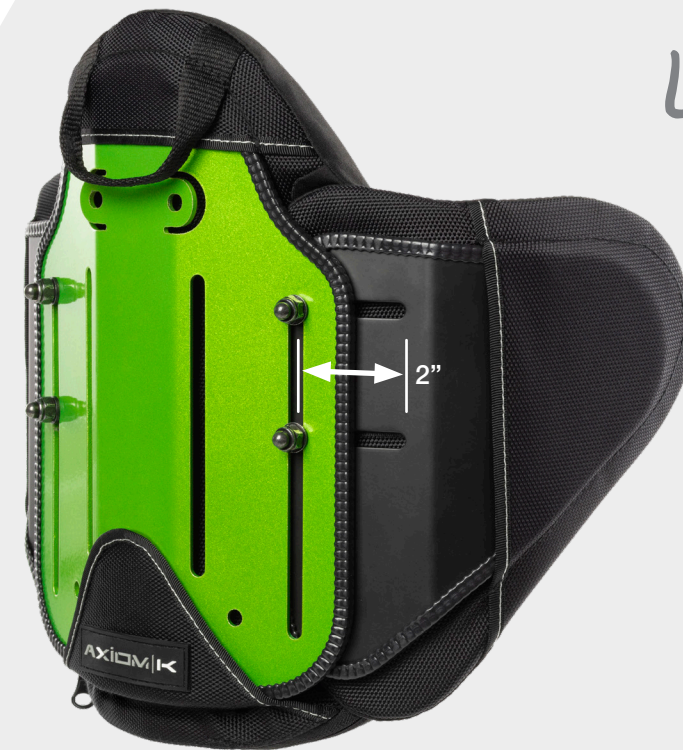
AL Back with contoured laterals