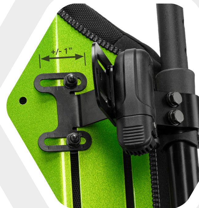
DEX for Kids

Setup and growth is easy with intuitive depth and angle adjustments, along with the ability to fit chair widths +/- 1". With three models and three lateral options - Axiom for Kids is the most versatile range of pediatric back solutions on the market.